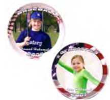
3 1/2" Buttons with Name