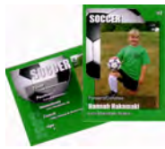
2-Sided Trading Cards