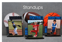
Stand Up Plaque