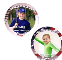
3½" Buttons with Name