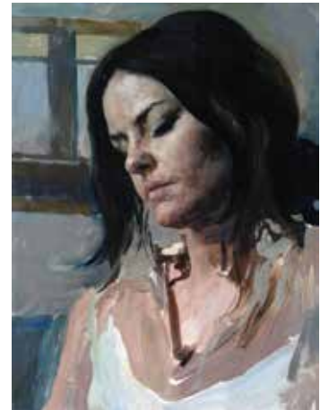
(LEFT) SUZIE BAKER (b. 1970), To Every Purpose , 2017, oil on linen, 40 x 20 in., collection of the artist ■ (TOP RIGHT) KWANI POVU WINDER (b. 1989), In His Eyes , 2017, oil on linen, 20 x 16 in., private collection ■ (CENTER RIGHT) LEE GUK HYUN (b. 1983), The Girl in the Dream , 2015, oil on canvas, 24 x 18 in., Lotton Gallery, Chicago ■ (BOTTOM RIGHT) HOLLIS DUNLAP (b. 1977), Susan 2 , 2016, oil on panel, 16x12in., Sirona Fine Art, Hallandale Beach, Florida