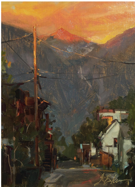
Alpenglow by Suzie Baker; Best Plein Air