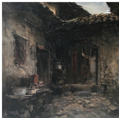
Fireworks in Old House by Kui Zheng; First Place Overall

The First Place winners in the six yearly contests each earn $1,000, with $500 going to Second Place and $250 going to the Third Place winners. In mid-April, the $21,000 in annual prizes will be awarded to the annual winners at the 2018 Plein Air Convention & Expo, in Santa Fe, New Mexico.