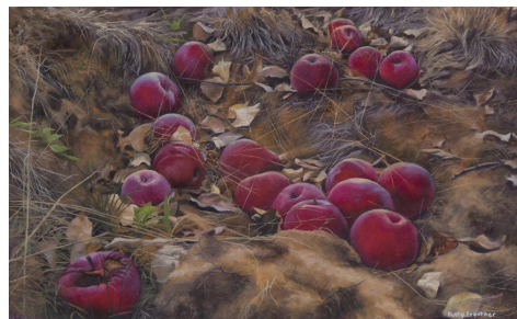
Phi Apples by Rusty Frentner; Best Outdoor Still Life