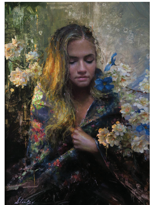
Dream Garden by Kyle Stuckey; Best Figure