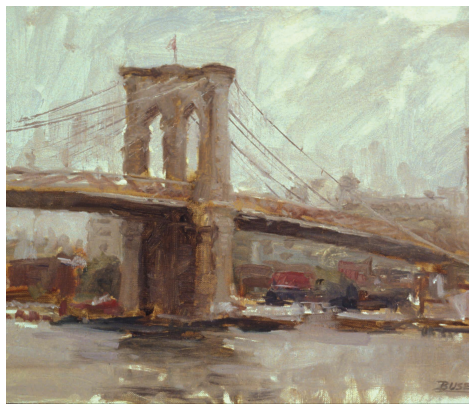
The Brooklyn Bridge by Ellen Buselli; Best Building