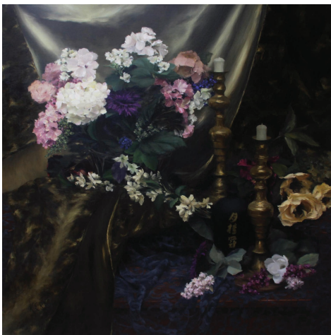
Chinese Vase by Kerri Mcauliffe; Best Floral in a Landscape