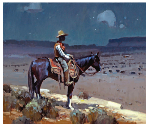
Nite Shift by Jim Wodark; Best Western