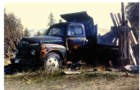
Passage of Time by Alan Wylie; Best Vehicle