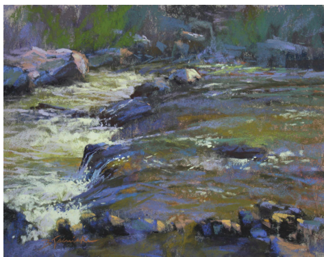
Water on the Move by Barbara Jaenicke; Best Water in a Landscape