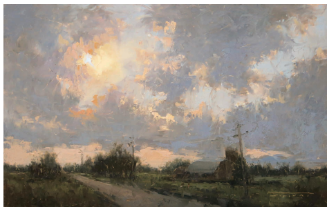
Q Road Sunset by Jane Hunt; Best Nocturne